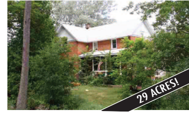
8465 ROGERS ROAD, EAST JORDAN Brick two story farmhouse 4BR and barn on 29 acres on Rogers Road. Mostly wooded with 2 babbling sandy bottom streams. MLS 437884. Ask for Holly Nierman $109,000