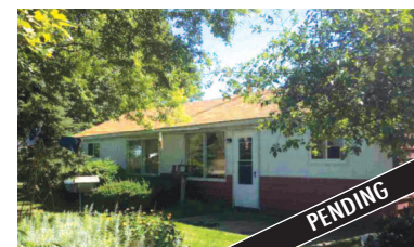
07748 ROGERS ROAD, EAST JORDAN This stick built home is in a great location close to town. Two beds, with the possibility of a third. Fenced back yard. MLS 438405. Ask for Chris Oliver $59,000