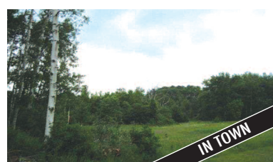
750 SEVENTH STREET, EAST JORDAN This is a beautiful piece of property right on the edge of town. Acreage is on a dead end street and very private. !MLS 430403. Ask for Jennifer Burr $18,900