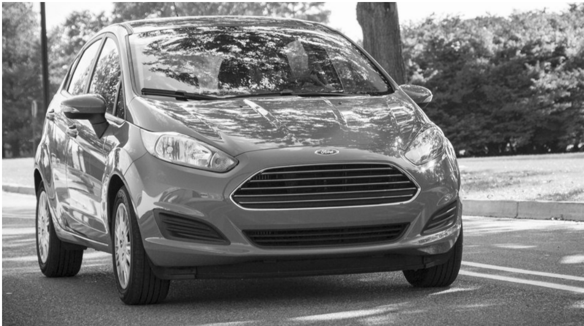
Ford announced today that Auto Start-Stop will be available on 70 percent of its North American vehicle lineup by 2017.