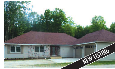
6749 ALBA RD, GAYLORD Spacious ranch in an impressive wooded setting close to town. New wood floors, new carpet, new furnace & appliances. MLS 437610. Ask for Mike Stark. $184,900