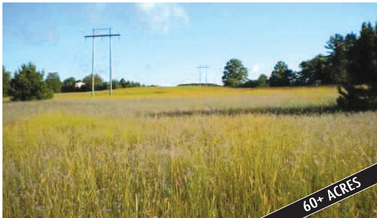
TBD MILES ROAD, EAST JORDAN • $155,000 Over 60 acres of prime hunting property with road frontage on both Miles Rd. (paved) and Nelson Rd. Beautiful Ranney Creek flows through the south end of the property. Mix of pasture and forest provides shelter and food for an abundance of wildlife. Possible timber options as well. Parcel has been surveyed and approved for numerous splits. Tons of potential! Call today for more information! MLS 436383. Ask for Holly Nierman.