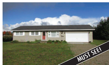
923 S INTERMEDIATE LK. • CENTRAL LAKE Squeaky clean home with a spacious back yard! 2-car garage. A short walk to all-sports Intermediate Lake public access!!! MLS 438787. Ask for Mike Stark. $87,500