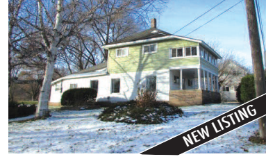
1009 WATER, EAST JORDAN Nice home on the edge of East Jordan, Two car detached garage, Paved drive. Large lot with lots of room for the kids to play. MLS 438945. Ask for Chris Oliver. $79,900