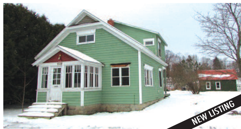
628 MAIN STREET, BOYNE CITY • $68,000 Conveniently located in the City of Boyne City. Near schools, shopping and Lake Charlevoix. Needs a little TLC but won't take much to move right in! MLS 439052. Ask for Mike Stark.