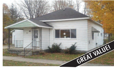
7957 BROOKS STREET, CENTRAL LAKE Great in town location 2 blocks from the park & Intermediate Lake! Many updates just completed. Large fenced back yard. MLS 438882. Ask for Mike Stark. $65,900