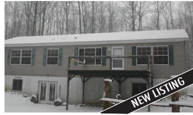
3701 AUNT FERN'S, EAST JORDAN Looking for privacy, and 10 acres with a home? Here is your chance! Near snowmobile trails and great hunting both deer and mushroom. MLS 438995. Ask for M Holly Nierman. $112,900.